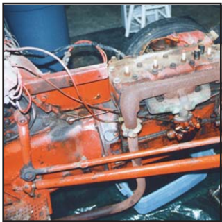
Clean Oil and Grease